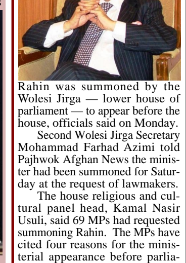
Minister of Information and Culture Syed Makhdoom Rahin is summoned by the Wolesi Jirga to appear before the house on Monday.

KABUL: Minister of Information and Culture Syed Makhdoom Rahin was summoned by the Wolesi Jirga — lower house of parliament — to appear before the house, officials said on Monday.