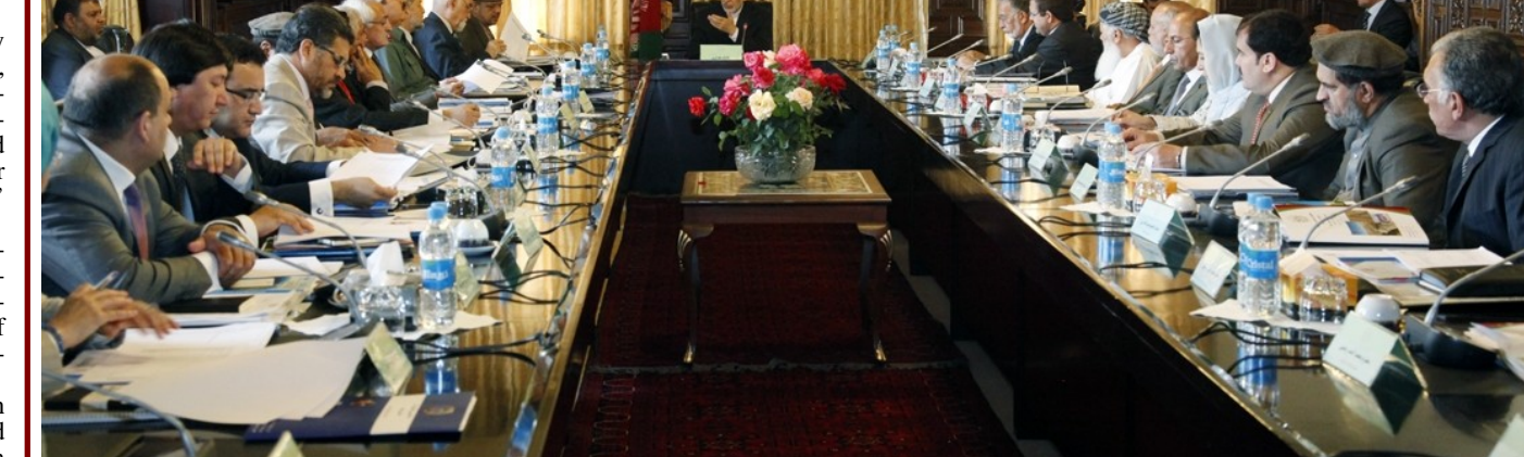
KABUL: President Hamid Karzai chairing a plenary session of the Council of Ministers (CoM) here at the Presidential Palace on Monday.