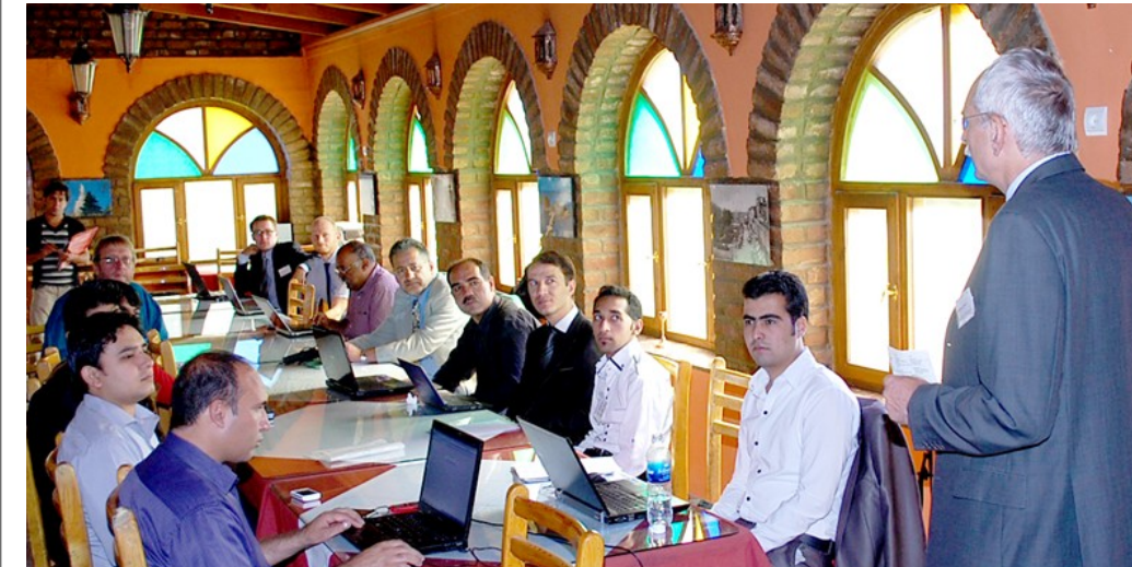
A 3-day workshop to promote Open Source software like Linux and Open Office and to boost up software opportunities for Afghan public administration institutions was launched in Kabul on Monday.

KABUL: A 3-days workshop to promote Open Source software like Linux and Open Office and to boost up software opportunities for Afghan public administration institutions was launched in Kabul.