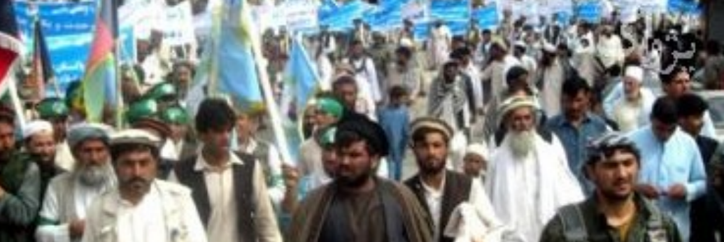
Residents and political workers in Kunar province on Monday staged a demonstration to condemn periodic attacks on the province.

ASADABAD: Residents and political workers in Kunar province on Monday staged a demonstration to condemn periodic attacks on the province.